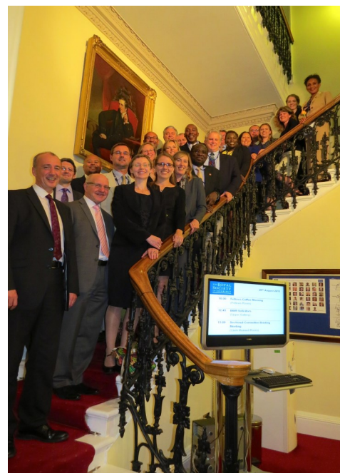
2013 U.S.-U.K. Fulbright Seminar Cohort